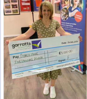
Garratt Solictors Donation